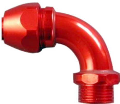
90 degrees Aluminum Connector for oil resistant over braided flexible rubber conduit. Oil resistant, liquid tight.