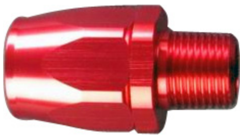
Straight Aluminum Connector for oil resistant over braided flexible rubber conduit. Oil resistant, liquid tight.

These conduit fittings clamp the inner conduit and the braiding tightly, and keep the conduit assembly liquid tight when subject to pressure or machine vibrations.