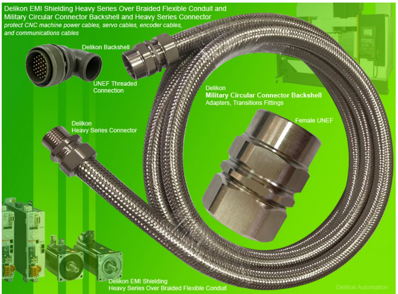
Delikon EMI Shielding Heavy Series Over Braided Flexible Conduit and Military Circular Connector Backshell and Heavy Series Connector protect CNC machine power cables, servo cables, encoder cables, and communications cables

Delikon Military Circular Connector Adapter is designed to connect a cylindrical connector to flexible conduit. Together with Delikon EMI Shielding Heavy Series Over Braided Flexible Conduit and Heavy Series Connector, this over braided flexible conduit assembly provides reliable protection to the cables connecting to Military Connector and is widely used for the automotive, robotics, machine tool and welding industries, as well as numerous other commercial applications from heavy equipment to ECG monitoring cables..